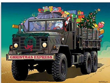
Santa testing a potential upgrade to his sleigh!