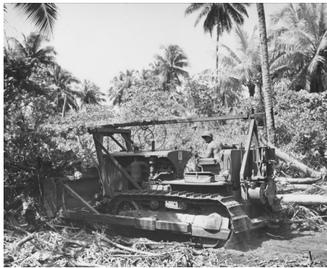
Seabee operating a Caterpillar D8 on a Project in the South Pacific, WWII

It's amazing how fast the word travels When everyone's ear's to the ground, Paul Revere rode a snail when compared to the gale That can scatter a rumor around.