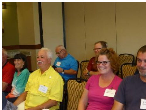
Laughter is Good for the Soul