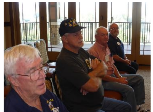
Time for a Snooze ??