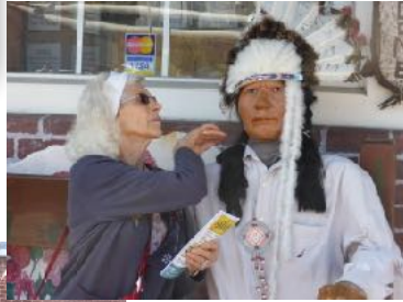
Whooping it up in McCaysville at left and above.

Our Twelfth Reunion officially “kicked off” on Friday afternoon with. Presentations from the Mayor, Events and other Support Leaders; who all contributed significantly to the success we enjoyed.