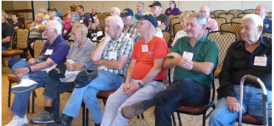
Good to see the Smiles on their Faces!! (Above)