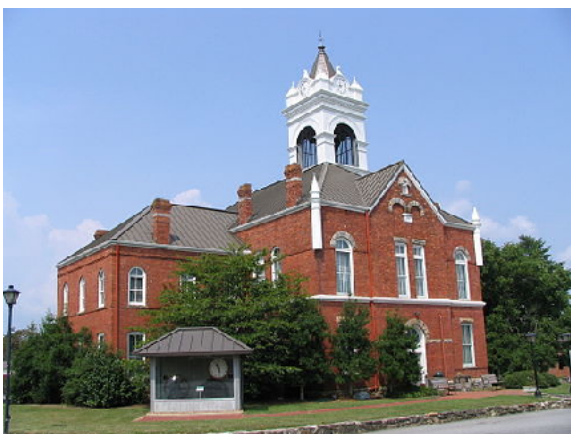
Historic Union County Courthouse Blairsville, GA