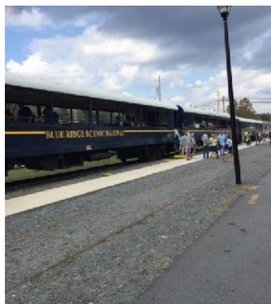
Blue Ridge Scenic Railroad Excursion to McCaysville