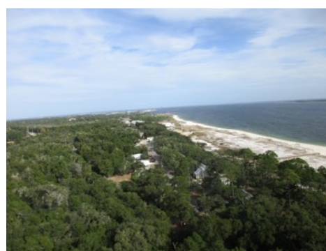
Pensacola Beach View from a Tower