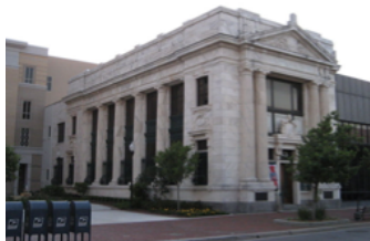
First National Bank, Palafox Place