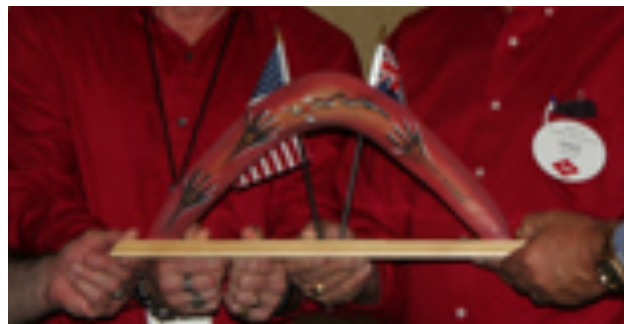
The Boomerang Up Close