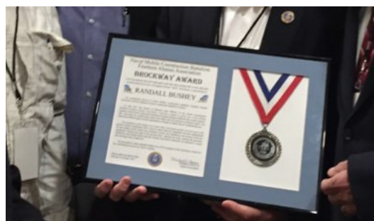
Right - The 2015 Brockway Award