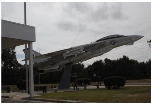
At Entrance to NAS Air Museum