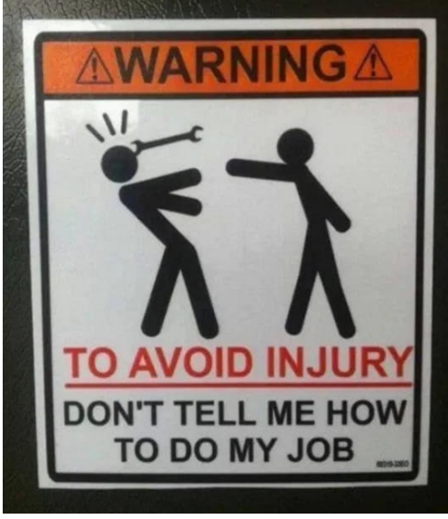
(Seen on a random Seabee's Toolbox)