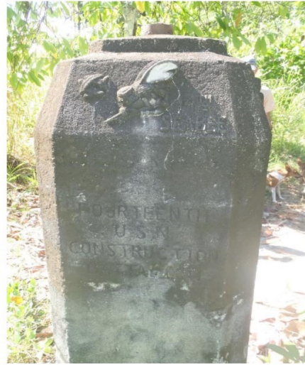
NCB 14 In Guadalcanal, 1942

This is a monument to the 14 th NCB for their work and sacrifices on Guadalcanal in 1942. This was a base for a flag pole. The steel pole long since eroded away, leaving but a small nub left on top of the monument.