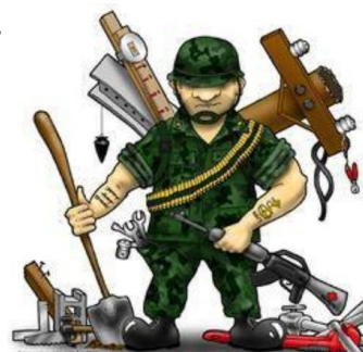
Seabee: (see-bee) n. A fully Automatic, Overworked, Under Paid, MRE Fed, Beer Cooled, Amphibious Animal that thrives on Military Intelligence.